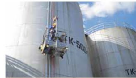
Dalan Chemistry, Istanbul - Turkey