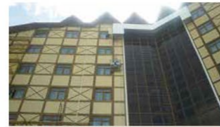
Polat Hotel, Erzurum - Turkey