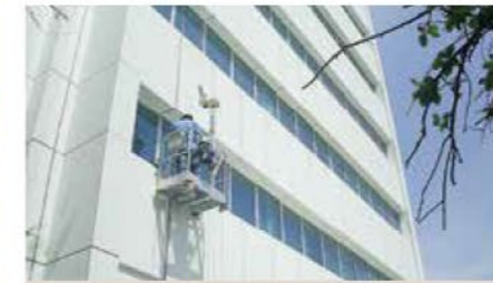
Social Security Institution, Istanbul - Turkey