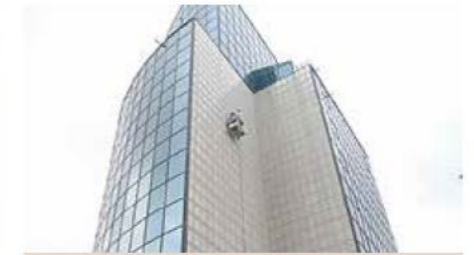
Odak Construction, Istanbul - Turkey